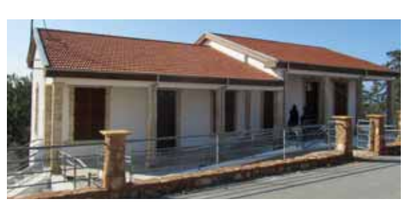
The renovated building of the old kindergarten in Kormakitis, which presently operates as Folkloric Museum.