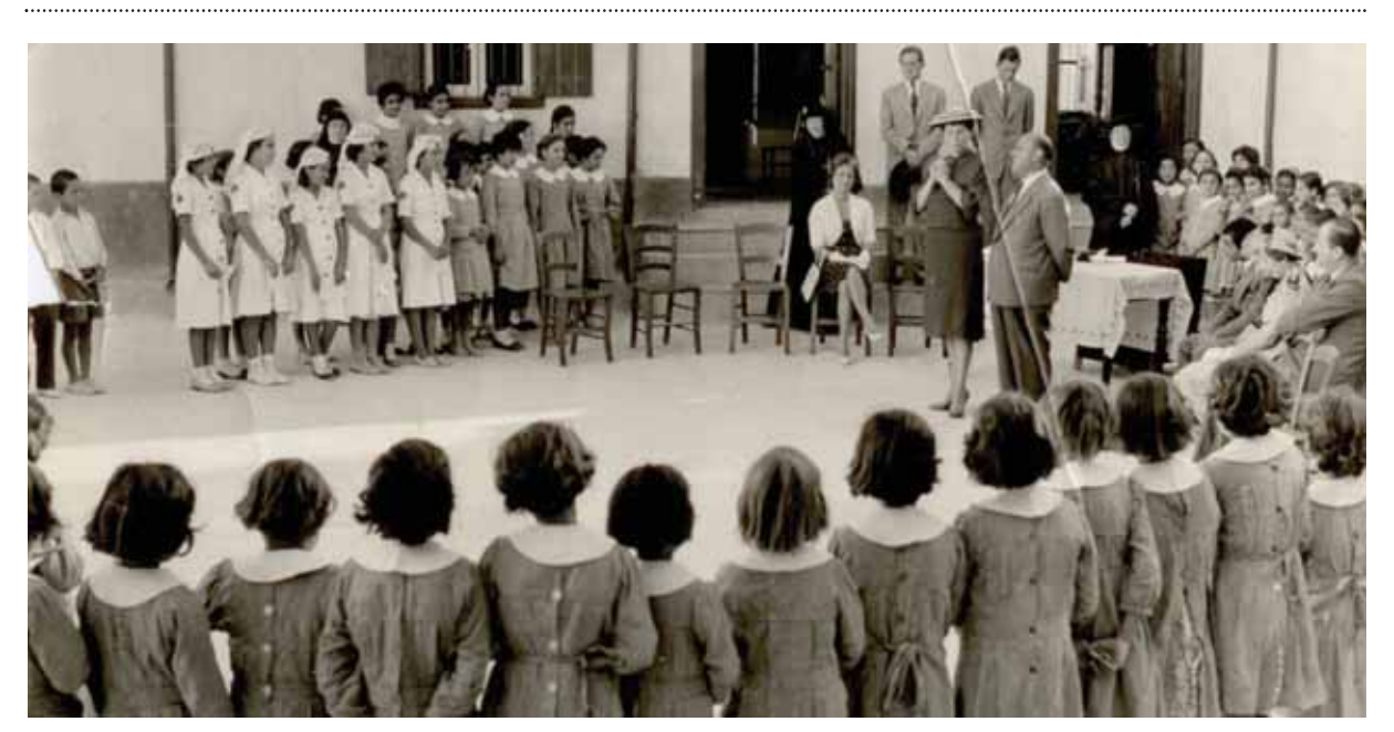
• Visit of Lady Sylvia Foot at Kormakitis School for Girls (1959).

represented in the House of Representatives by an elected Representative (Law 12/1965).