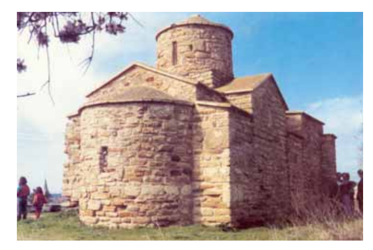
• The chapel of the Virgin Mary in Kambyli.

Byzantine Era: The first appearance of Maronites in Cyprus dates to the late 7th century (686 AD), during the reign of Byzantine Emperor Justinian II – the Maronites arrived on the island in flight from Arab raids and religious clashes in Syria and Lebanon. Cyprus became a safe haven for the Maronites, who continued to arrive on the island up until the early 8th century, choosing to immigrate to Cyprus whenever they faced severe pressure from their religious opponents. In 938 AD, after the Arab destruction of Saint Maron's Monastery in Apamea, Syria, a large wave of Maronites left the region for a number of neighbouring countries, amongst them Cyprus; it was also during this period that the Maronite Patriarchate was relocated to Lebanon. In 1090 the Maronites established a monastery dedicated to Saint John the Chrysostom in the village of Koutsovendis in the Kyrenia district.