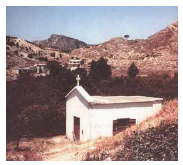
• Saint Anthony's chapel in Kythrea.