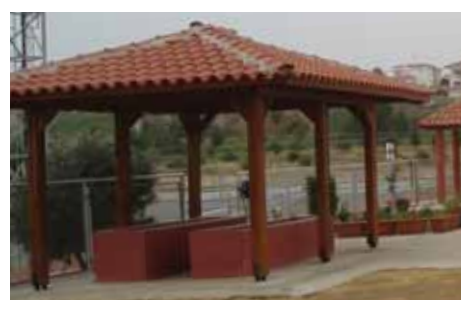
• The "Saint Maron" kindergarten in Anthoupolis.