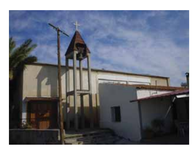
Saint Marina's church in Polemidhia.