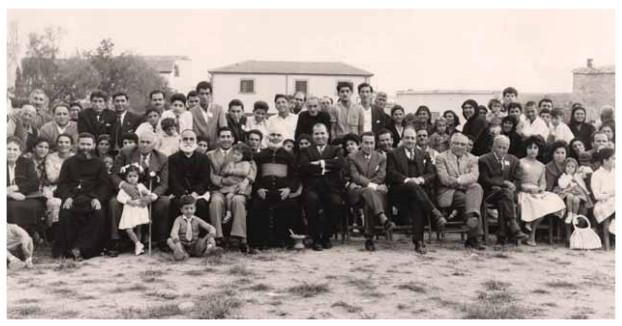
• The people of Kormakitis in a commemorative photograph (1950s).