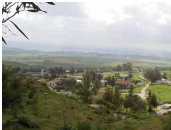
• The occupied Karpasha village.