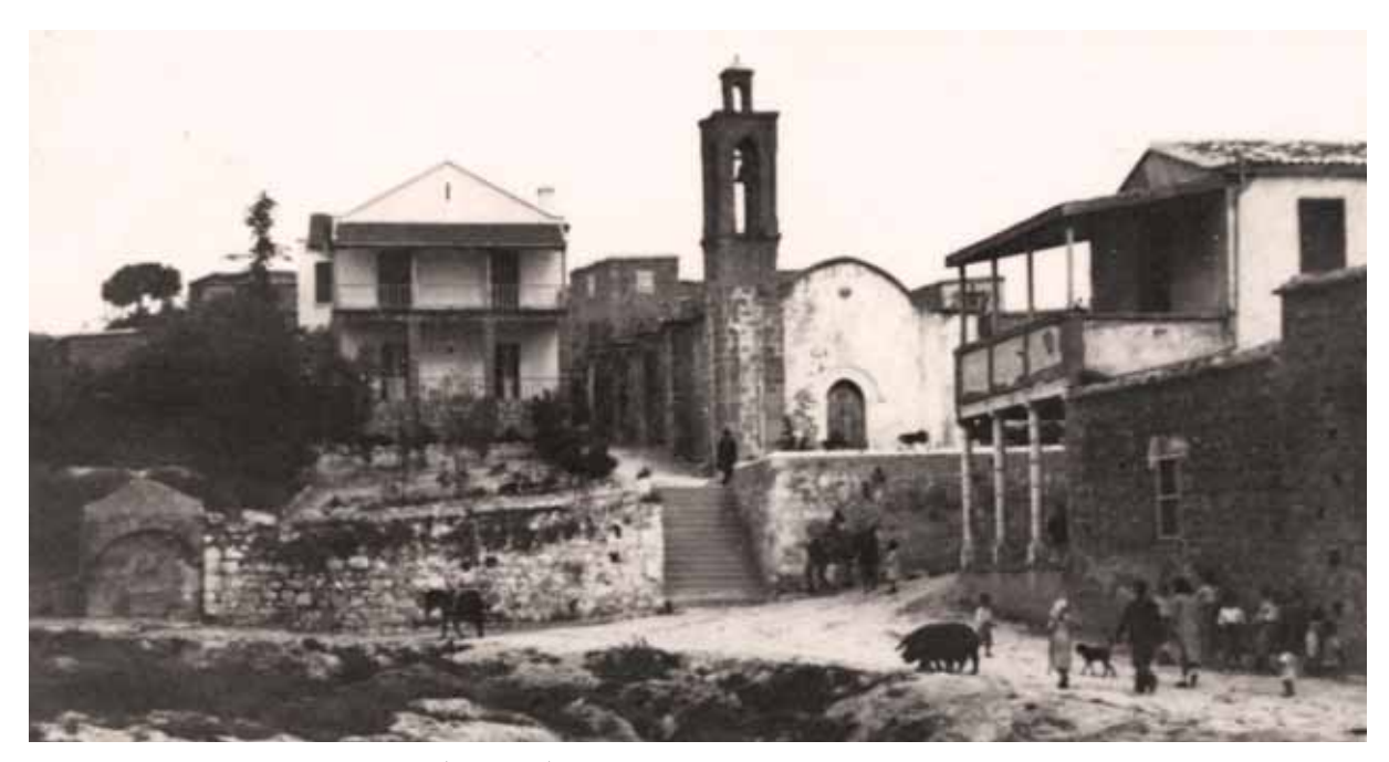
• Rare photograph from Kormakitis square (early 1930s). The old Saint George's church is visible in the background.

Venetian Era: In 1489 Cyprus became a colony of Venice and remained so for almost a century, until 1570. The harsh administration of the Venetians, in combination with the calamities that hit the island and the Muslim raids, were an impediment to the development and prosperity of the Maronites of Cyprus. Many Maronites were forced to convert to the Latin rite to survive, while others were persecuted. By the end of the Venetian Era, the number of Maronite villages had been reduced to 33.