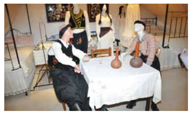
The Folkloric Museum in Kormakitis has been operating since February 2012.

The Maronite community established a folkloric museum in occupied Kormakitis in 2012 with donations from the UNDP-PFF and the government of the Republic of Cyprus at the initiative of the Maronite Welfare Association of Cyprus and the "Kormakitis Trust" Heritage Club. In Kormakitis there is also an ecclesiastical museum, which was established in 2010 at Saint George cathedral with funding from the Anastasios G. Leventis Foundation.