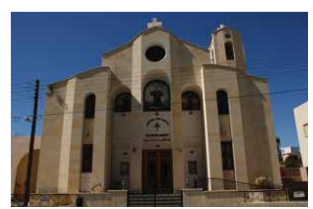
• Saint Sharbel's church in Limassol.

the Constitution of the Republic of Cyprus, were represented in the Greek Communal Chamber by a member of the Chamber elected by and from within their community. As a result of the inter-communal clashes between Greek and Turkish Cypriots in 1963-1964, the Greek Communal Chamber was abolished in 1965, and since then the Maronite community has been