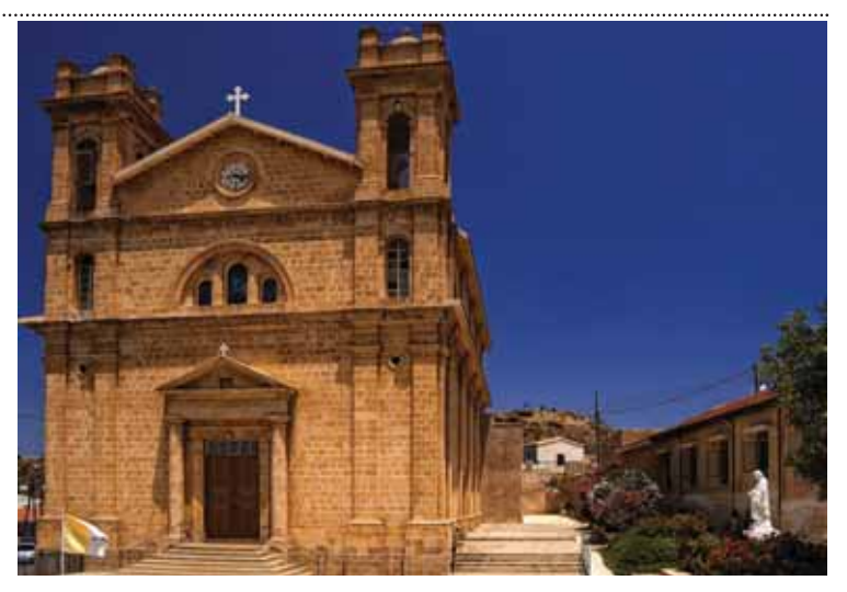
Saint George's cathedral at Kormakitis square.

The new favourable conditions facilitated the demographic growth of the Maronite community and helped improve the quality of life of the Maronites. The community developed culturally and socially, establishing organised groups, churches, associations and schools. In 1928 Kormakitis and Ayia Marina each established a Cooperative Credit Society, amongst the first in Cyprus. The Asomatos Co-Op followed in 1929, the Karpasha Co-Op in 1930. Today, only the Kormakitis Co-Op remains in operation.