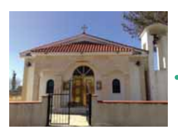
Saint Marina's church in Kochatis.