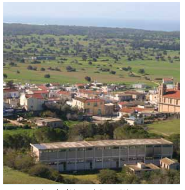
• Panoramic view of Turkish-occupied Kormakitis.

Despite the Turkish military occupation and the displacement of most Maronites from their villages, the Maronite community, assisted and supported by the government of Cyprus, has managed to preserve its mores and customs, and in 1988 the Maronite Archbishopric returned to Nicosia after 315 years. On 1 February 1995 the Republic of Cyprus signed the Framework Convention for the Protection of National Minorities, which includes the Maronites, the Armenians and the Latins, and on 17 October 2008 Cypriot Maronite Arabic (CMA) was recognised by the Republic of Cyprus as a minority language, based on the European Charter for Regional or Minority Languages of the Council of Europe. The community, small in size but rich in tradition, is organised socially and culturally and some of its members have distinguished themselves in the private and public sector, thus contributing to the cultural, economic and social development of Cyprus.