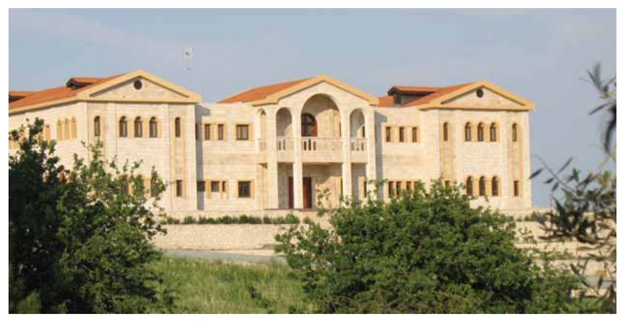
• The imposing dependency of the Prophet Elias Monastery in Kochatis.