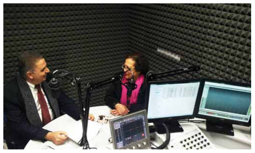
Snapshot from the production of "The Voice of the Maronites" radio programme.