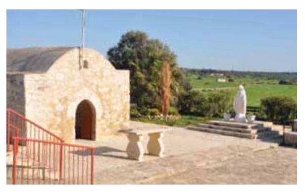
• The chapel of the Virgin Mary to the west of Kormakitis.

Karpasha: The Holy Cross church, which dates to the 15th century, was fully renovated in 1924. In the church there are two priceless wooden crosses: the purely Byzantine cross dates to the 15th century, while the Cypriot-Byzantine cross dates to the 17th century.