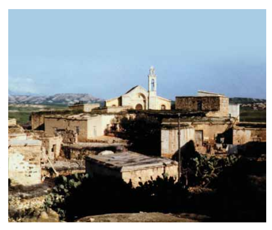
View of Turkishoccupied Asomatos.

percent of the island's Maronites refugees, while about 5 percent remained enclaved in Asomatos, Karpasha and Kormakitis. Seven Maronites were killed during the war and one is still missing. The Turkish Air Force bombed the renowned Prophet Elias Monastery and the village of Ayia Marina and seized the following churches: Sacred Heart of Jesus in Famagusta, Saint Anthony in Kythrea, Saint Romanos in Vouno, the Virgin Mary in Kambyli and the Virgin Mary of Marki. The village of Ayia Marina Skyllouras was taken over by the Turkish military authorities and was turned into a military zone – it remains inaccessible to this day. Access to the village of Asomatos, in the Kyrenia district, is also restricted, and its inhabitants are allowed into the village only on Sundays to celebrate Mass at the church of Archangel Michael.