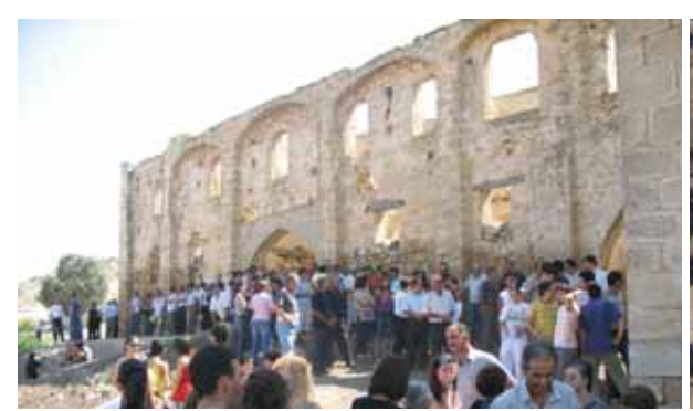
Photograph from the 2007 pilgrimage to the ruined Monastery of Prophet Elias.