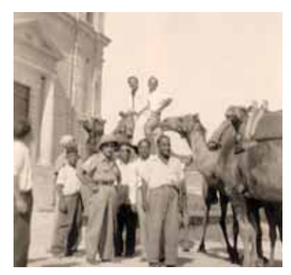
• Rare photograph with camels in front of Kormakitis' cathedral (1930s).