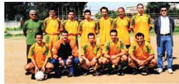
The Asomatos Youth Association football team.