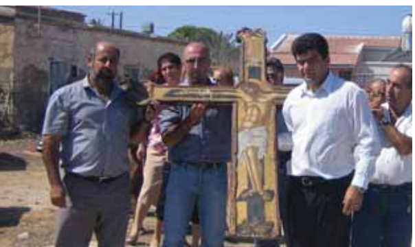
• The 15th century wooden cross, which is kept at the Holy Cross church in Karpasha.