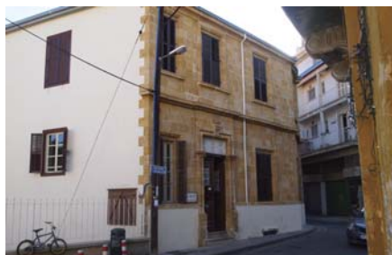
● Saint Joseph's Shelter for Foreign Workers in Nicosia.