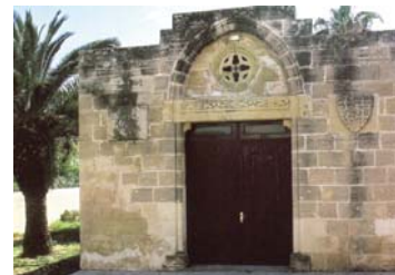
• Saint Elisabeth's church in Kyrenia.