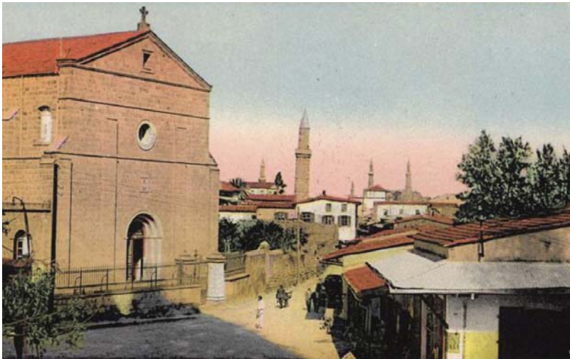
● The Holy Cross church in Nicosia in the early 20th century.

During the British Era (1878-1960), many Latins served as civil servants, entrepreneurs, bankers, doctors, merchants among other professions. At the same time, Saint Joseph's School was established in Nicosia (1884), as well as the Terra Santa Schools in Limassol (1923), Famagusta (1952) and Kormakitis (1936), which