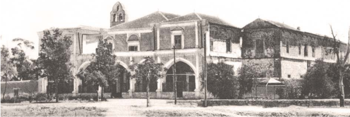
● Saint Joseph's Nunnery in Larnaka (mid-19th century).

while serving also as an important factor in the spread of francophony in Cyprus. With the numerical increase of Limassol's Latin population and in the spirit of fundamental reforms in the Ottoman Empire, known as the Tanzimat reforms, a Franciscan convent was established in 1850. Furthermore, in 1872 the erection of Saint Catherine's church began. Based on various estimates, the Latin community of Cyprus numbered around 400-600 persons in the mid-19th