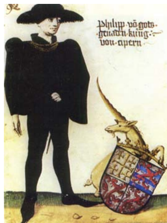
● King James II de Lusignan (1463-1473). Visible to the right below is the Lusignan dynasty crest.