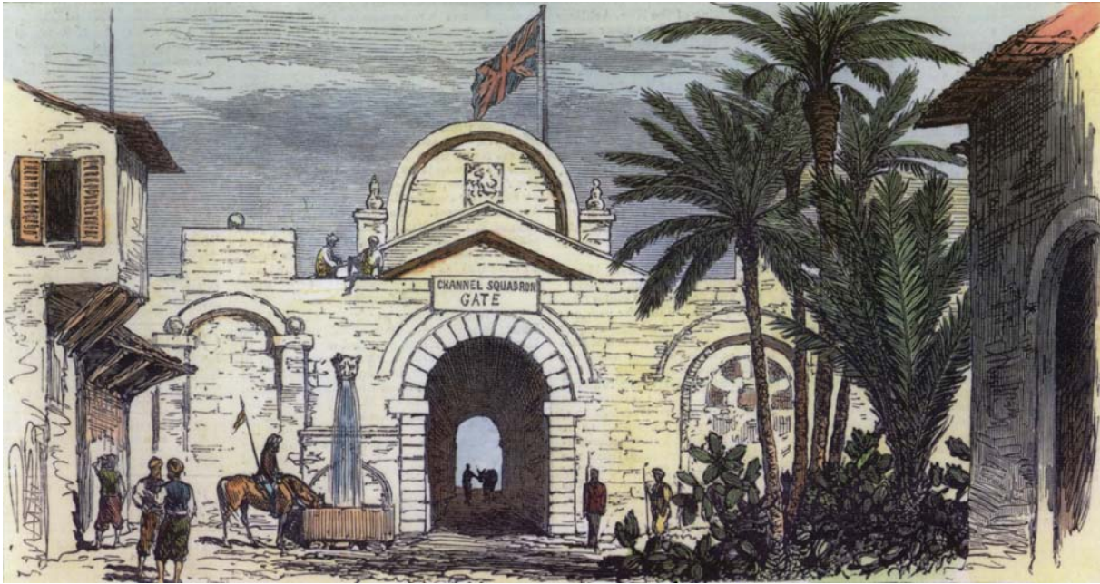
● The impressive Famagusta Gate (1878).