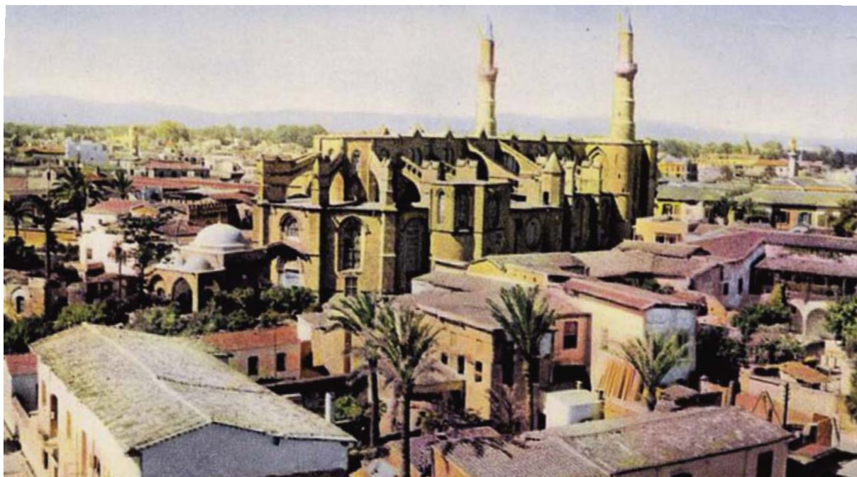
● Old post-card showing Saint Sophia's cathedral in Nicosia, which was turned into the Selimiye mosque by the Ottomans.

Although most Latins perished, the Franciscans did manage to return and establish in 1596 the Holy Cross Monastery in Nicosia and the Monastery of Our Lady of Graces in Larnaka; these establishments were also used for the accommodation of European merchants, seafarers and travellers. At the same time, a small Latin community timidly began to form in the early 17th century, mainly in Larnaka, initially by Venetians, as the Most Serene Republic of Venice had entered into a peace agreement with the Ottomans in 1573. Contributing to the increase of Larnaka's secular Latin population was the presence of the consulates, which offered protection and employment opportunities to various Europeans.