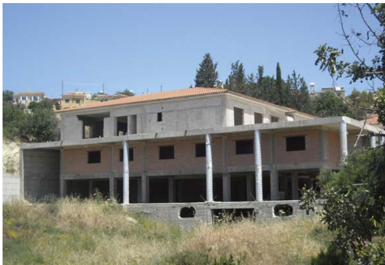
● Saint Michael's Hospice under construction in Mesa Khorio.