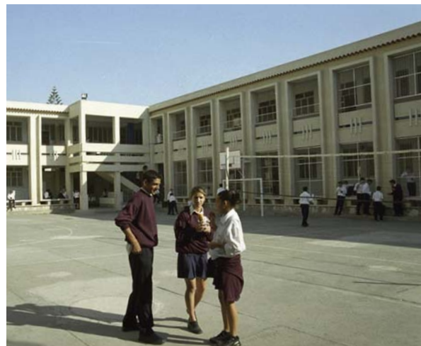
● Saint Mary's School in Limassol.

Other Latin educational institutions used to operate in the past, leaving their mark in the history of education in Cyprus. Such were Saint Joseph's Schools in Larnaka (1844-1990), Limassol (1877-1921) and Nicosia (1884-1987), run by nuns of the Order of Saint Joseph of the Apparition; the Terra Santa Schools in Larnaka (1844-1939 and 1950-1956) and Limassol (1860-1939 and 1951-1956), run by Franciscan monks, as well as the Terra Santa Schools in Kormakitis (1936-1981) and Famagusta (1952-1974), run by Nuns of the Order of the Sacred Heart of Jesus. During 1999-2011, the Latin parish of Pafos operated the "La Souris Verte" kindergarten.