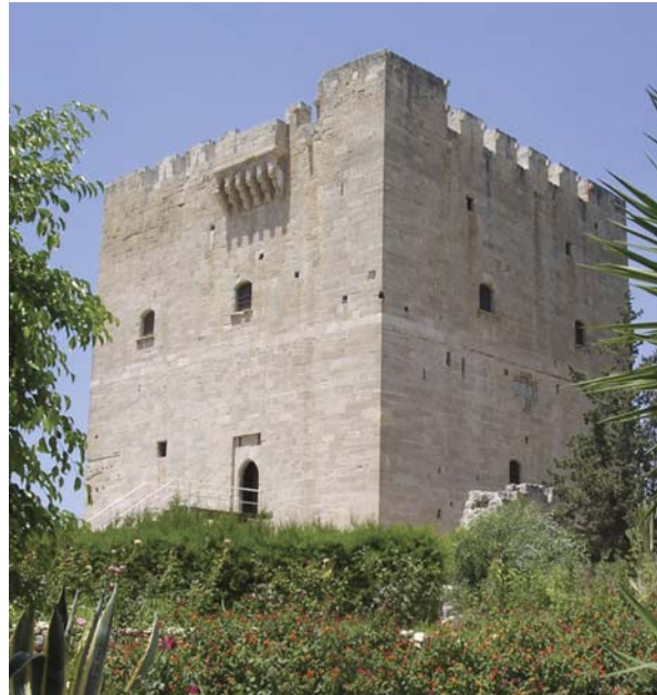
● The Kolossi castle in Limassol.

There is a longstanding link between Latins (Cypriot Roman Catholics of European descent) and Cyprus, dating back to 1126, when privileged merchants from Venice and Genoa settled on the island. However, the history of the Latin community in Cyprus actually began in 1192, when the titular Frankish King of Jerusalem, Guy de Lusignan, purchased the island from the crusader King of England, Richard I the Lionheart, who had seized it in 1191. In his attempt to establish a Western-type feudal kingdom, the new lord of Cyprus sent emissaries to Western Europe, Cilicia and the Levant, inviting to the island bourgeois noblemen, knights and warriors. Consequently, a massive migration of Roman Catholic Christians and other peoples took place, to whom fiefs, manors and privileges were generously granted.