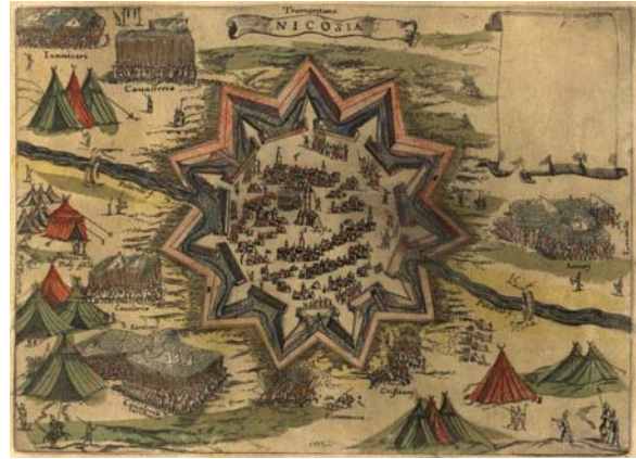
● Mediaeval map of Nicosia (1573).