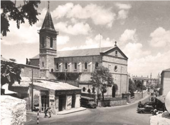
● The Holy Cross church in Nicosia in the 1950s.