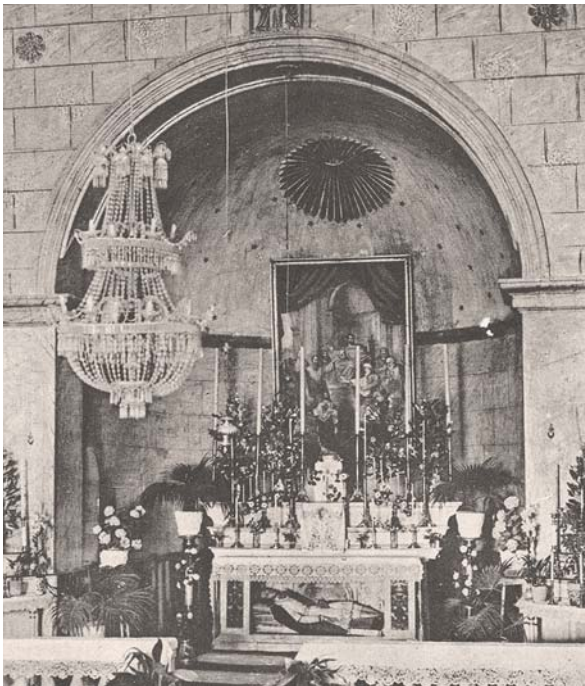
● Old photograph of the chapel of Saint Joseph's Nunnery in Larnaka.