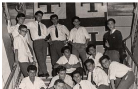
● Terra Santa School's graduates in Nicosia (1957).