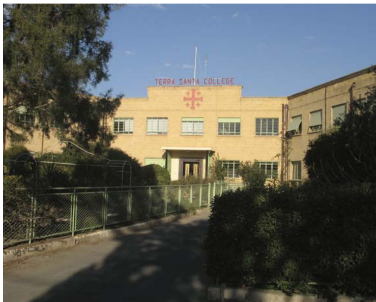
● The historic Terra Santa College in Nicosia.