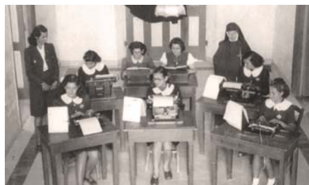
● Typing class at Saint Mary's School in Limassol (1945).