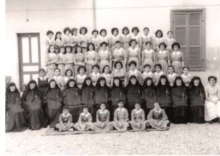
● Commemorative photograph of the graduates of Saint Mary's School in Limassol (1958).

Other Latin educational institutions used to operate in the past, leaving their mark in the history of education in Cyprus. Such were Saint Joseph's Schools in Larnaka (1844-1990), Limassol (1877-1921) and Nicosia (1884-1987), run by nuns of the Order of Saint Joseph of the Apparition; the Terra Santa Schools in Larnaka (1844-1939 and 1950-1956) and Limassol (1860-1939 and 1951-1956), run by Franciscan monks, as well as the Terra Santa Schools in Kormakitis (1936-1981) and Famagusta (1952-1974), run by Nuns of the Order of the Sacred Heart of Jesus. During 1999-2011, the Latin parish of Pafos operated the "La Souris Verte" kindergarten.