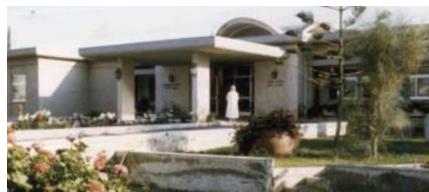
● The "Villa Regina Pacis" Rest Home in Larnaka.