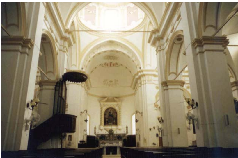
• The interior of the Catholic Church of Our Lady of Graces in Larnaka.