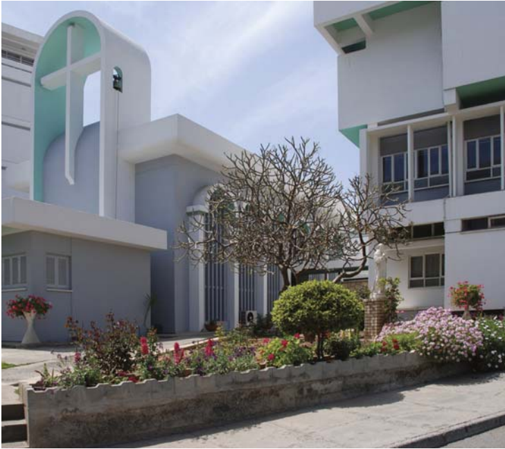
● Saint Mary's School in Limassol.