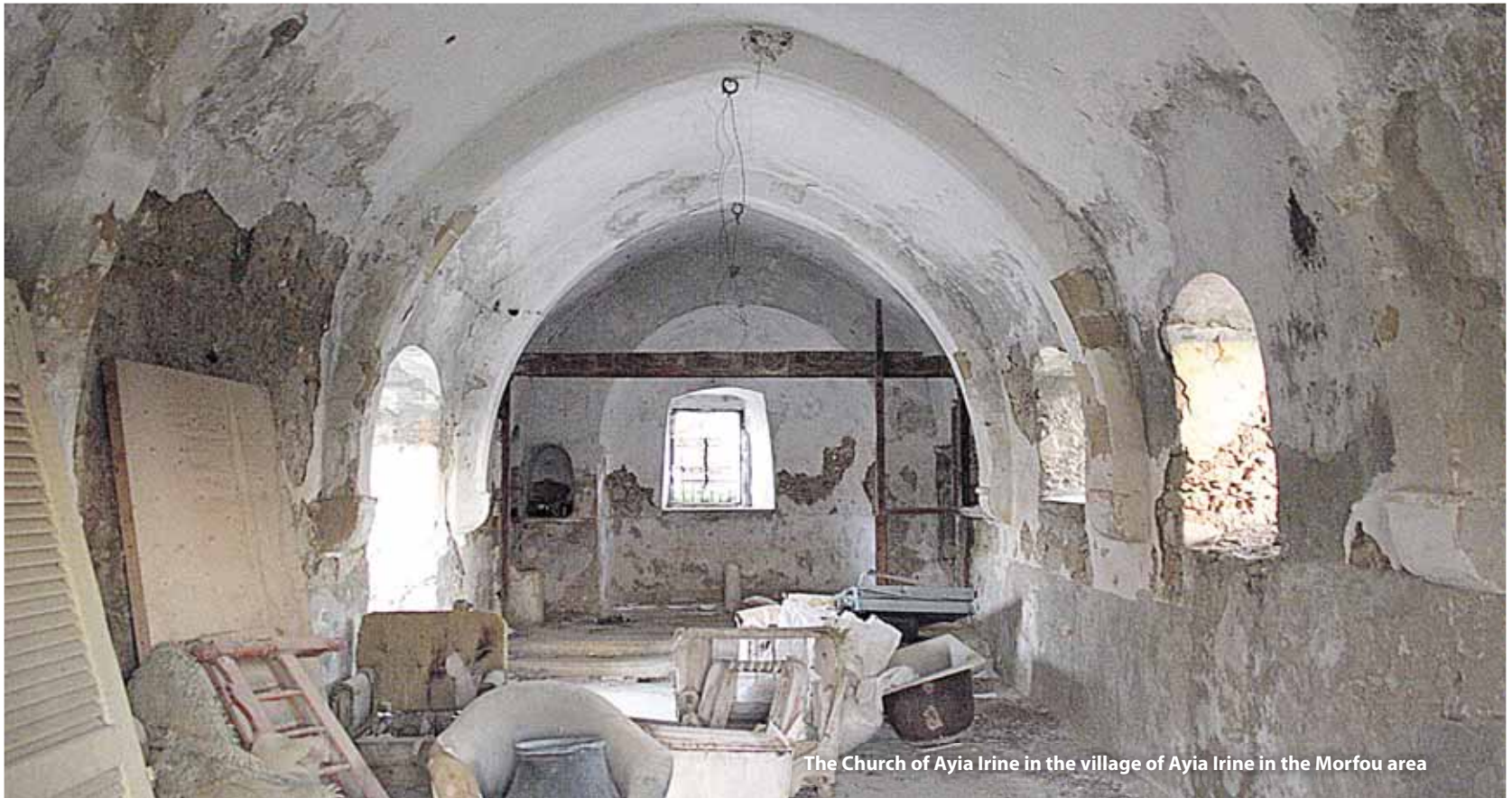
The Church of Ayia Irine in the village of Ayia Irine in the Morfou area

Turkey has been committing two major international crimes against Cyprus. It has invaded and divided a small, weak but modern and independent European state (since 1 May 2004 the Republic of Cyprus has been a member of the EU); Turkey has also changed the demographic character of the island and has devoted itself to the systematic destruction and obliteration of the cultural heritage of the areas under its military control.