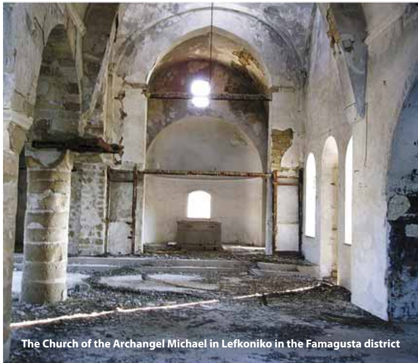
The Church of the Archangel Michael in Lefkoniko in the Famagusta district