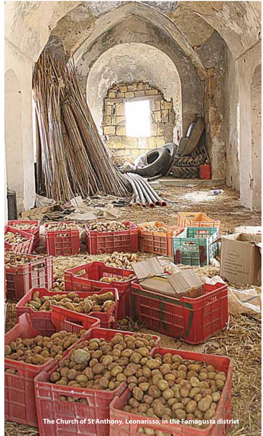
The Church of St Anthony, Leonarisso, in the Famagusta district

The forcible division imposed by Ankara in Cyprus was reinforced in 1983 by a "Unilateral Declaration of Independence" by the Turkish Cypriot leadership -at the instigation and with the support of Turkey- in the occupied area, and with the establishment of the so-called "Turkish Republic of Northern Cyprus." The international community directly and categorically condemned this secessionist action, while the UN Security Council declared the act was "legally invalid" and demanded the revocation of the "Unilateral Declaration of Independence." As a result, the illegal regime in occupied Cyprus has not been recognised by any state other than Turkey, the occupying power.