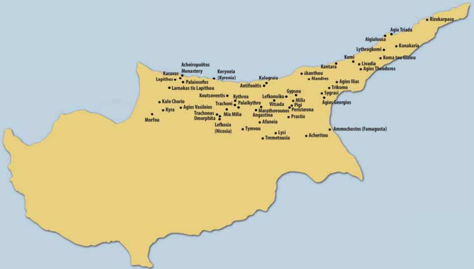
Map of Cyprus with towns and villages where the island's cultural heritage has suffered destruction and desecration since 1974 as a result of Turkey's military invasion and occupation.