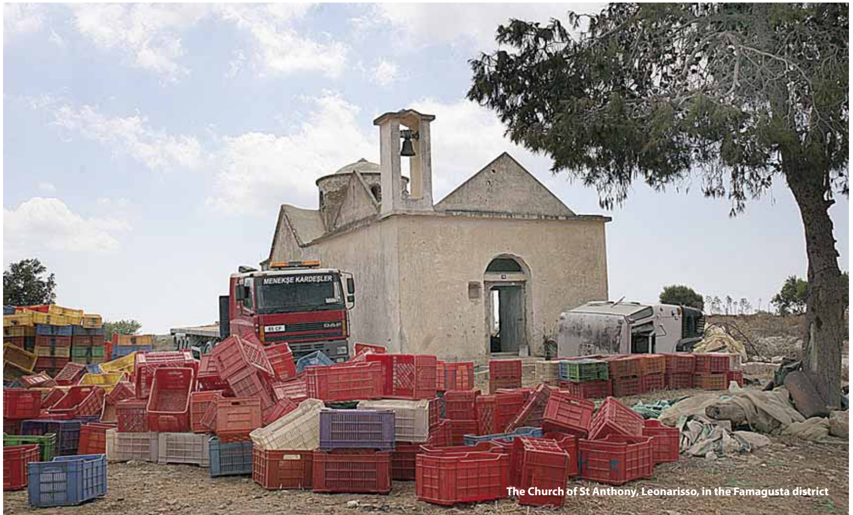
The Church of St Anthony, Leonarisso, in the Famagusta district

The island's natural wealth and strategic position essentially determined the course of its history – for thousands of years, Cyprus has endured invasion, conquest and spoliation by powerful empires. Beginning in the 11 th century BC, when its predominantly Greek character took shape, it has enjoyed periods of freedom, but for much of its history it has been subject to the rule of the Assyrians, the Egyptians, the Persians, the Romans, the Franks, the Venetians, the Ottomans and the British.