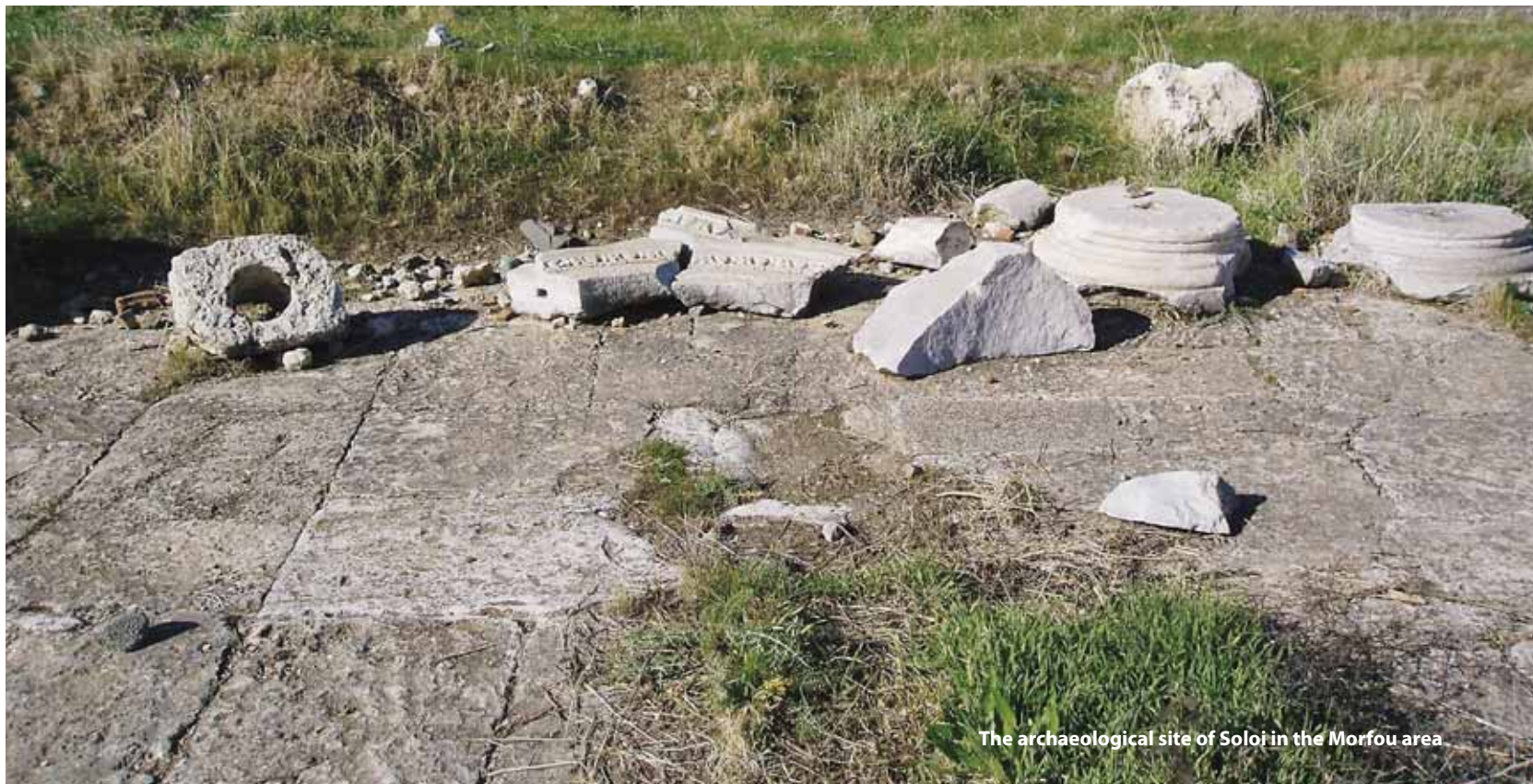
The archaeological site of Soloi in the Morfou area

In the summer of 2009, the U.S. Helsinki Commission [Commission on Security and Cooperation in Europe (CSCE)] held hearings in Washington, DC on “Cyprus’ Religious Cultural Heritage in Peril.” A well-documented report for the U.S. Congress on the state of the cultural and religious heritage in occupied Cyprus, pointing out that it was indeed “in peril,” was released during the same period. The report by the Law Library of Congress, entitled “Destruction of Cultural Property in the Northern Part of Cyprus and Violations of International Law,” also states that “under conventional and customary law, Turkey, as an occupying power, bears responsibility for acts against cultural property.”