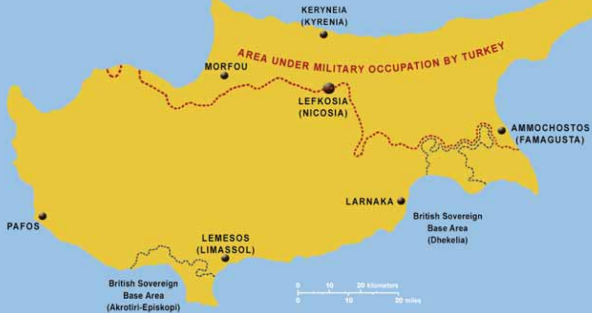
Map showing the 1974 UN ceasefire line across the Republic of Cyprus and the areas of the Republic under military occupation by Turkey.