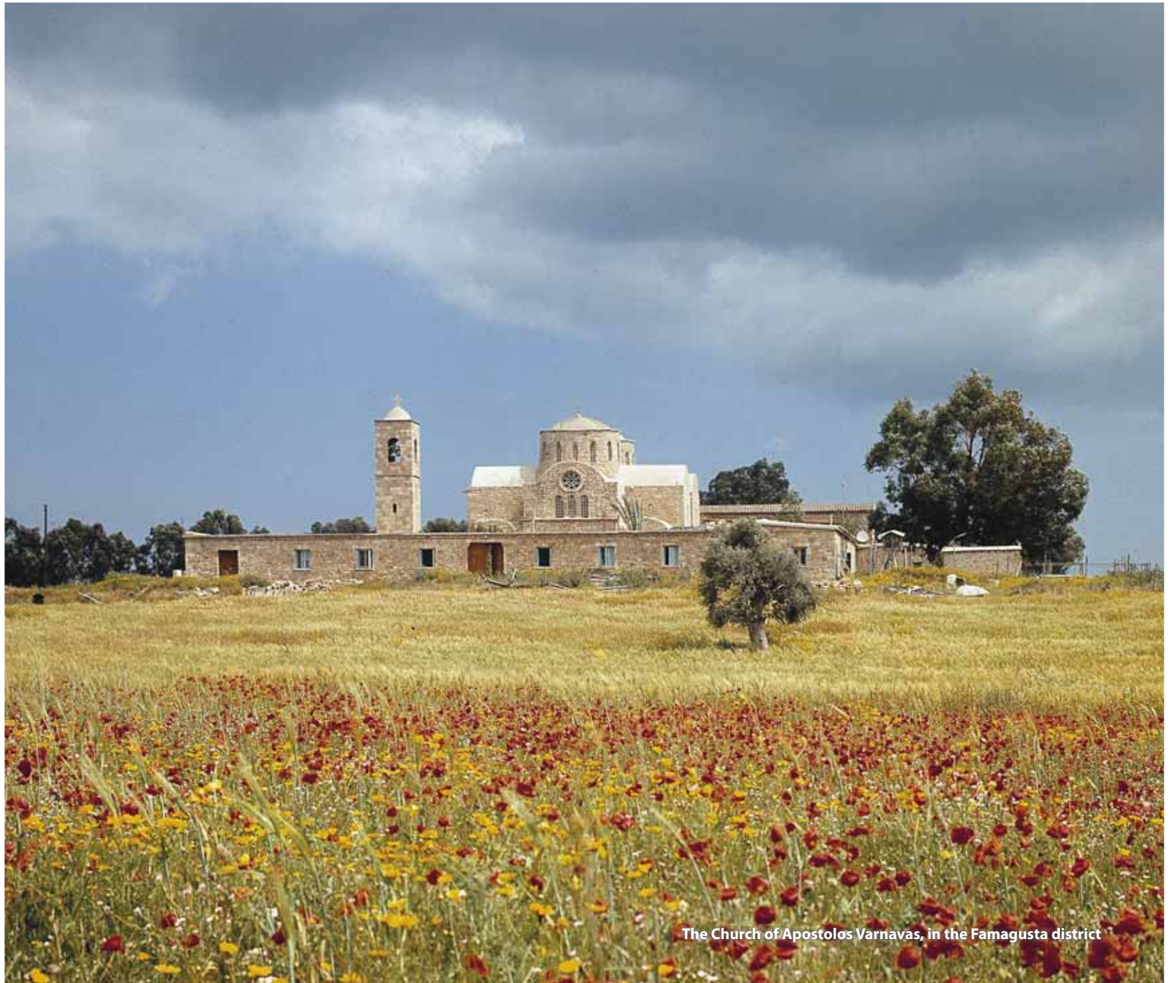
The Church of Apostolos Varnavas, in the Famagusta district