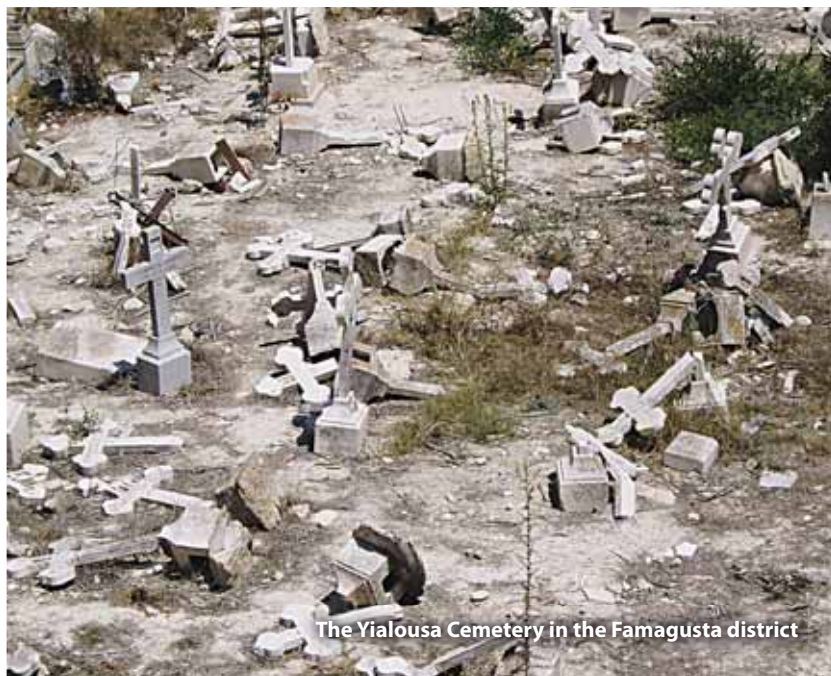
The Yialousa Cemetery in the Famagusta district

The churches have been subject to the most violent and systematic desecration and destruction. More than 500 churches and monasteries have been looted or destroyed: more than 15,000 icons of saints, innumerable sacred liturgical vessels, gospels and other objects of great value have literally vanished. A few churches have met a different fate and have been turned into mosques, museums, places of entertainment or even hotels, like the church of Ayia Anastasia in Lapithos. At least three monasteries have been turned into barracks for the Turkish army (Ayios Chrysostomos in the Pentadactylos Mountains, Acheropoiitos in Karavas and Ayios Panteleimonas in Myrtou). Marvelous Byzantine wall-paintings and mosaics of rare artistic and historical value have been removed from church walls by Turkish smugglers and sold illegally in America, Europe and Japan. Many Byzantine churches have suffered irreparable damage, and many cemeteries have been desecrated or destroyed.