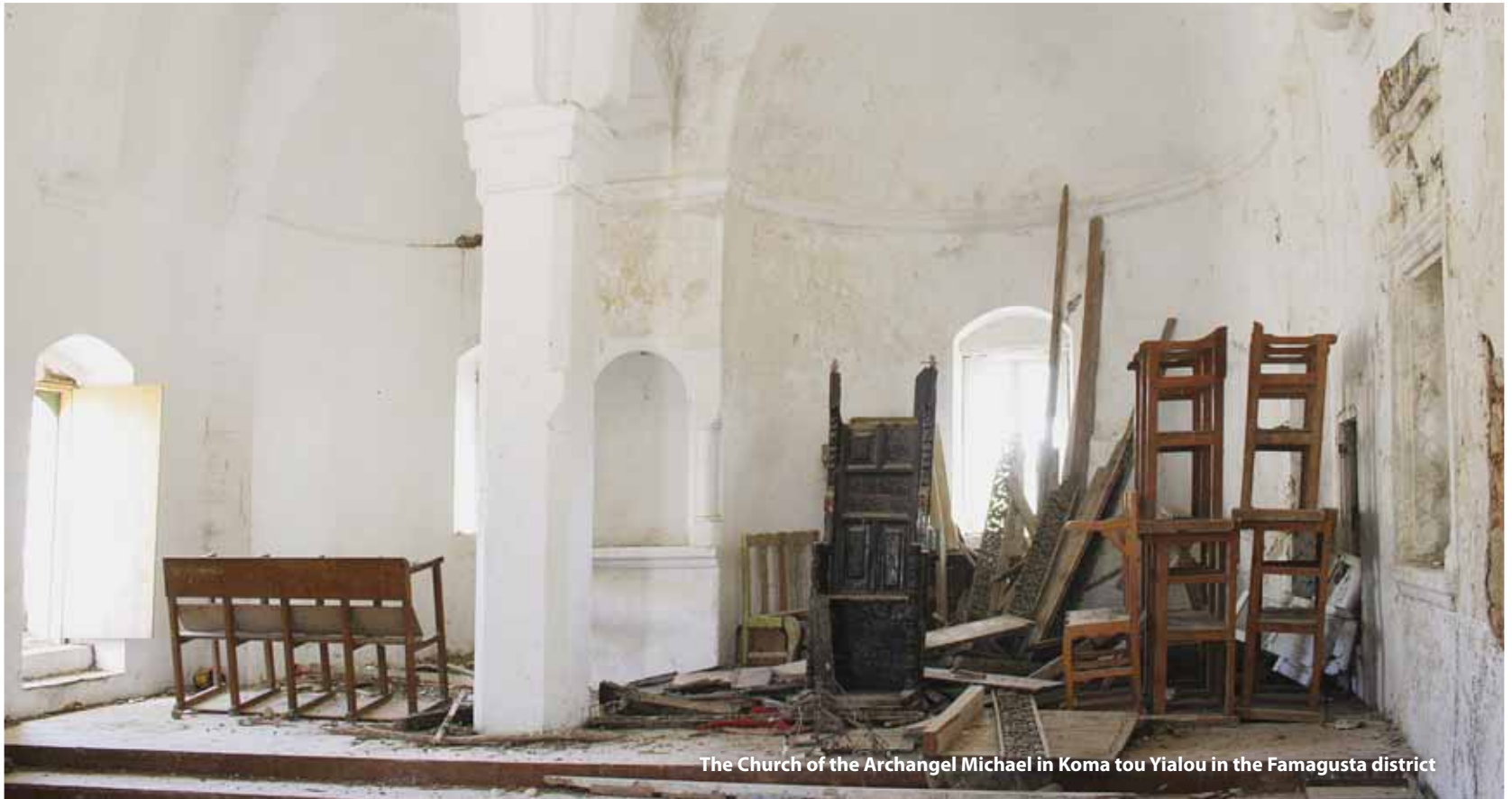
The Church of the Archangel Michael in Koma tou Yialou in the Famagusta district

after Turkey's invasion of Cyprus, wrote, "the vandalism and desecration are so methodical and so widespread that they amount to institutional obliteration of everything sacred to a Greek." ("The Rape of Northern Cyprus," The Guardian , 6 May 1976).